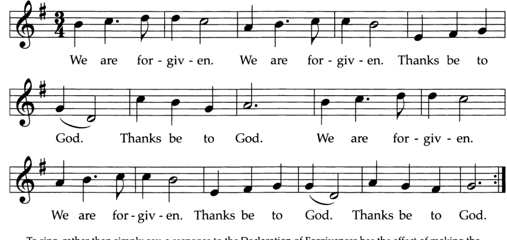
To sing, rather than simply say, a response to the Declaration of Forgiveness has the effect of making the moment both more affirmative and more corporate. The musical repetition of the two sentences also strengthens awareness of what it means to be assured of God's pardon.